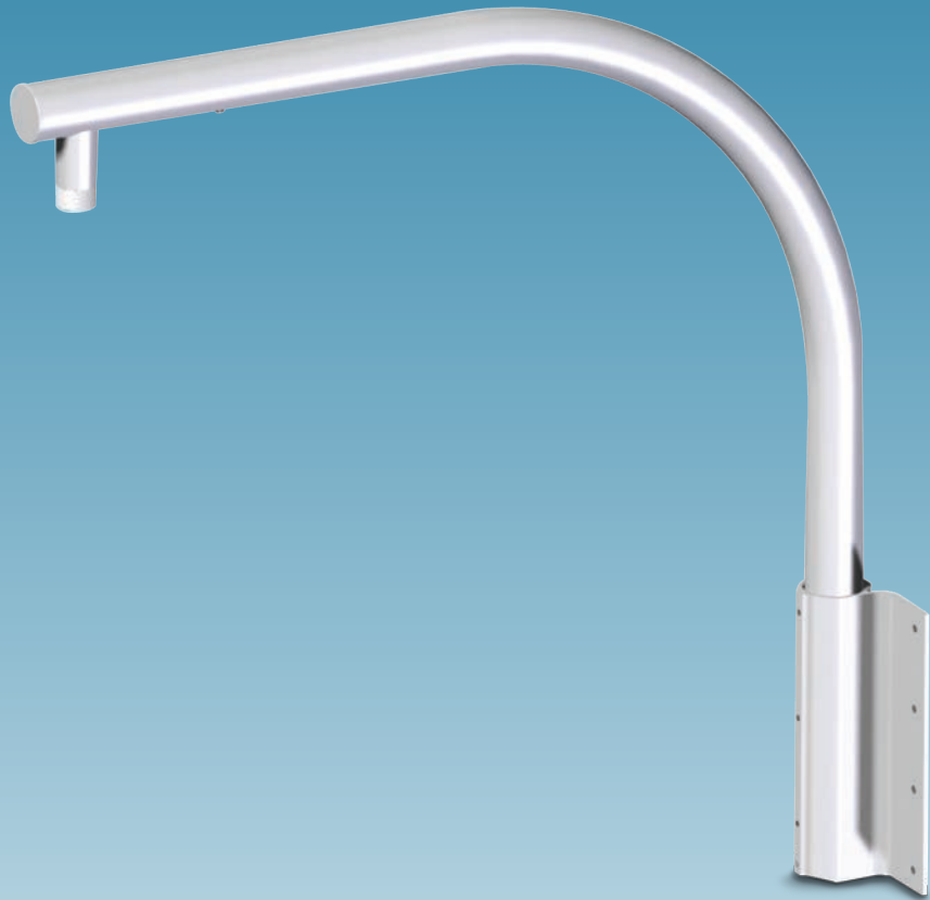
PRM50G Parapet Mount Bracket